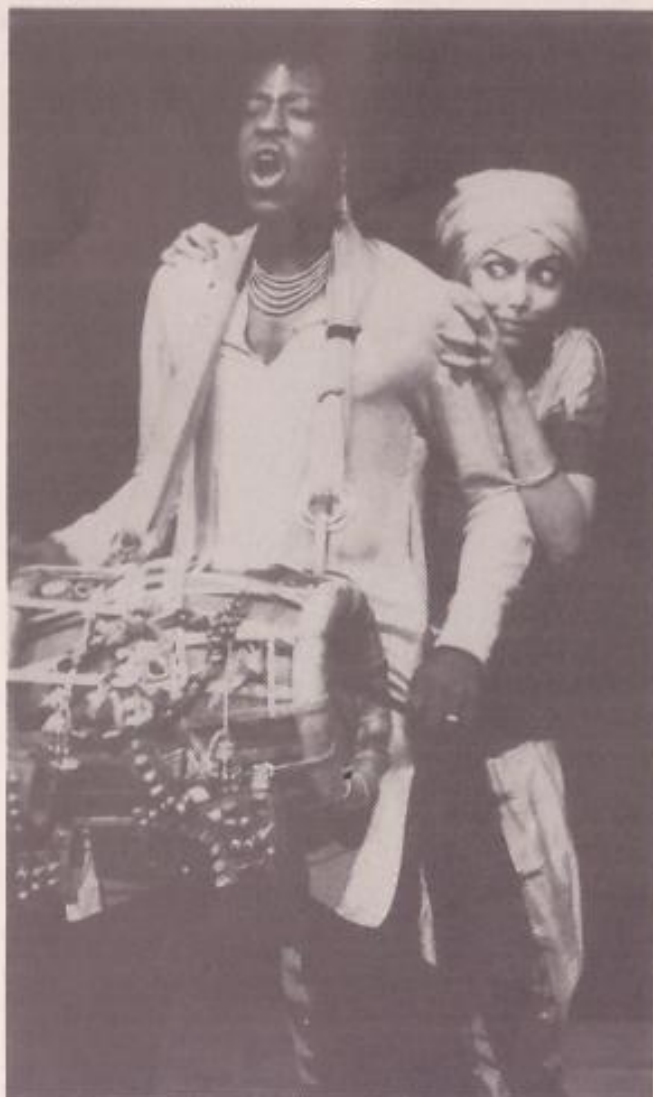
THE TELLERS OF TIME

has since worked with mime theatre companies in Paris and London. Tuup , an accomplished percussionist with several groups including Fusion and Turning Point, has also developed a vibrant style of story-telling.